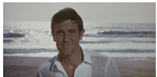
George Lazenby as James Bond in “On Her Majesty’s Secret Service”

Bond’s character and the changes to it have been hugely dependant on the different actors that have taken on the role. This is why the structure of these chapters is based on the succession of actors cast to play it. So far, Bond’s character and indeed the whole films were built and established around Connery, so when he quit the role, he left behind a void that proved very hard to fill. The balance between the uncompromising spy, the charming gentleman and the eternal womaniser is not easy to hold, and George Lazenby’s failure to win over the audiences and, notably, the producers, stands testimony to this. His very appearance, younger and less experienced looking than Connery, to the point that one might call his features too “soft” seems to