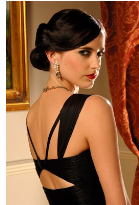
Eva Green as Vesper Lynd in “Casino Royale”

Eva Green as Vesper Lynd, the woman whom Bond falls in love with in “Casino Royale” (2006), acts the part of a remarkably intriguing character. At first glance, Vesper hardly differs from her predecessors: By 2006, for a woman to double-cross Bond and sarcastically dismantle his ego was nothing special any more. However, Vesper is so central to the plot that Green gets to play in enough scenes with intimate conversation to add credibility and roundness to her character, which she masters impressively.