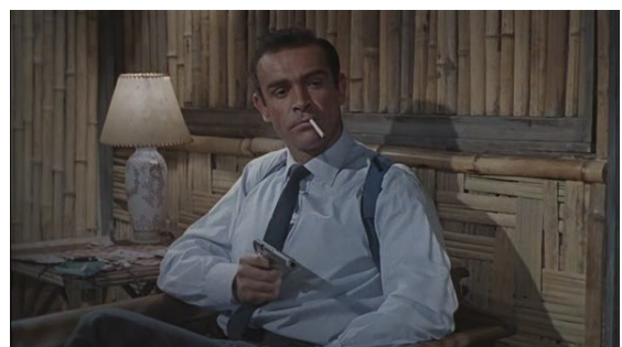
James Bond (Sean Connery) shoots Prof. Dent in "Dr. No"