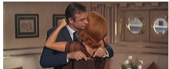
Brandt seduces Bond and then leaves him behind on a crashing plane in the following scene. Taken from “You Only Live Twice”

Volpe, the other Bond Girl in this film, can be described as a classic “femme fatale”. She succeeds in seducing and misleading Bond, and almost has him killed while dancing with him. However, Bond manages to use her body to catch the bullet at point blank, making her the first female villain to die by what is arguably Bond’s doing 13 .