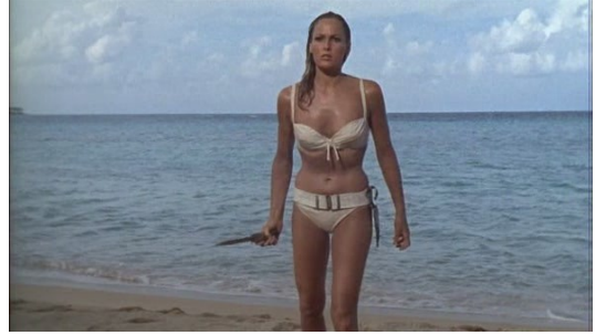
Ursula Andress as Honey Rider in “Dr. No”

The image of strong-willed, yet ultimately submissive women was quite well suited to the sixties, with the touch of independence generally viewed as modern and liberal. And it