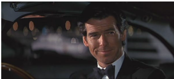
Pierce Brosnan as James Bond in "Goldeneye"

The scene that, in my opinion, best sums up these new aspects to Bond's character and relations takes place near the start of "Goldeneye". He receives a message from Miss