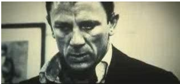
Daniel Craig as James Bond in “Casino Royale”

A revolution was promised, and one look at the next Bond film, “Casino Royale” (2006) is enough to prove that this promise has been fulfilled. While previous films had always started with Bond as a proven and longstanding secret agent, this film starts with a man still busy obtaining his famous licence to kill, a process, it is explained, that requires two executions. And these are not completed with a deft piece of trickery, some eye-catching stunt and an injection of dark humour. Daniel Craig, the first blond Bond and as such a very controversial choice, steps up and ruthlessly kills his two targets with no more than a wry smile briefly visible on his lips. Especially the first kill makes it clear what Broccoli means by a return to more “brutal and realistic” 37 fights. Shown entirely in black and white, Bond wrecks a public toilet while wrestling with his victim, drowns him a washbasin and then shoots him when it appears that he isn’t really dead.