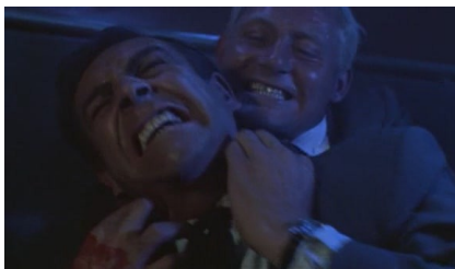
Sean Connery as James Bond in “From Russia With Love”, and Roger Moore in “Live and Let Die”

The differences between Connery’s and Moore’s Bond are most vividly illustrated by a juxtaposition of two scenes taken from “From Russia With Love” 27 and “Live and Let Die” 28 . Both depict an epic fight with the villain’s henchman in a train compartment near