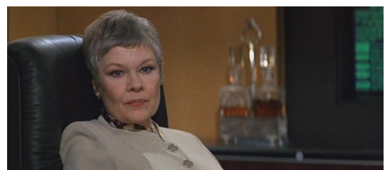
Judi Dench as M in “Goldeneye”

Pierce Brosnan's first two films marked the return of many old traditions, but when it comes to women they were quite a goldmine of innovation. Many were startled when Judi Dench was revealed as the new M, and rightly so. After all, this meant that a woman was now officially superior to Bond, which had so far been unheard of. Dench brings a kind of toughness to the role her male predecessors