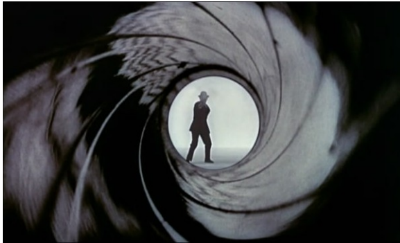
Taken from the gun-barrel sequence in "Dr. No"

On the most superficial level, namely that of the structure of the films' plot, the "Bond Formula" has stayed remarkably consistent. All of Eon's films start with (or, in the case