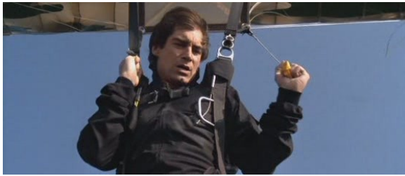
Timothy Dalton as James Bond in “The Living Daylights”

However well the comic elements that became increasingly central to Bond's character may have worked out, after seven films in twelve years with Moore as Bond, both the actor and his trump card – witticisms – seemed stretched. Consequentially, it might have